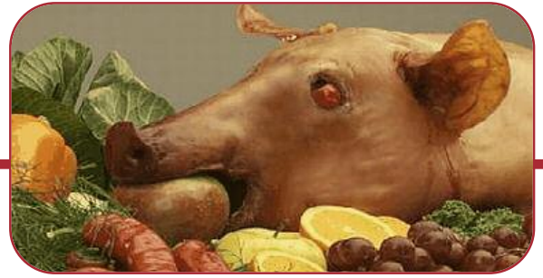
Displayed with apple in mouth and cherries in the eyes.

2135 Bustard Road, Suite 8, Lansdale PA 19446 610-584-6212 • www.allaboutcatering.com